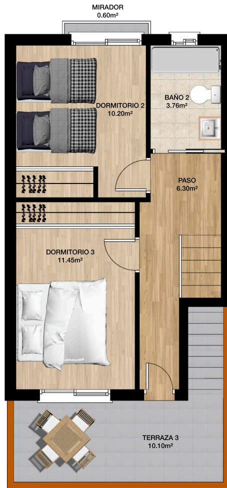
PLANTA PRIMERA FIRST FLOOR